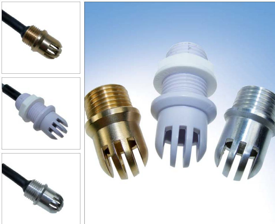
Thimble sensors in stainless steel, brass and white plastic