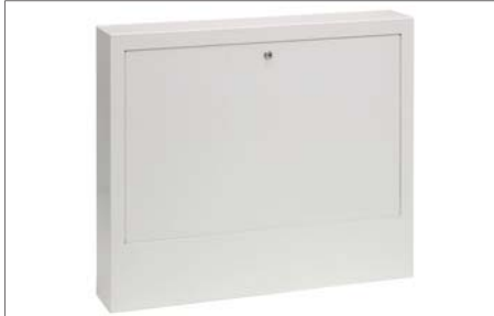
In-wall manifold cabinet