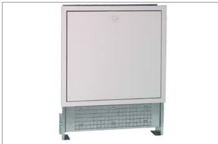
In-wall manifold cabinet