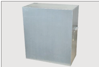
Re-usable manifold cover